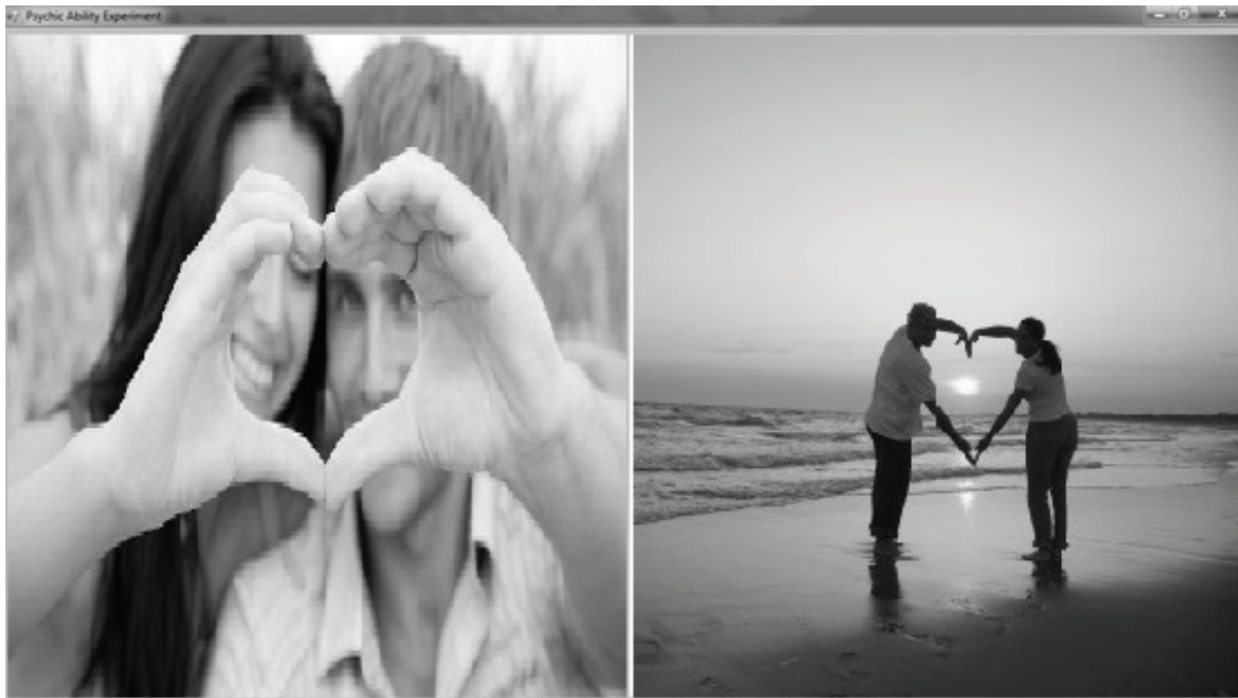
Figure 2. Example stimuli for the positive reward condition.

Unbeknown to the participants, this image preference task constituted a forced-choice, nonintentional precognition task, as each time they indicated their preferred image from the pair the computer immediately selected one of the images at random as the target. Directly after each trial, participants were administered a positive or negative reward for their performance by means of a secondary image preference task. If the participants' selection matched the computer's random selection, they entered the positive reward condition, and the secondary image preference task consisted of participants indicating their preferred image from one of the pairs of positive images (Figure 2). However, if the participants' selection didn't match the computer's random selection, they entered the negative reward condition, and the secondary image preference task consisted of participants indicating their preferred image from one of the pairs of negative images (Figure 3). No data were collected regarding participants' selections during the contingent reward tasks.