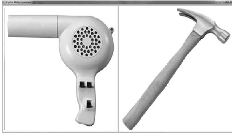
Figure 1. Example stimuli for the precognition task.

Unbeknown to the participants, this image preference task constituted a forced-choice, nonintentional precognition task, as each time they indicated their preferred image from the pair the computer immediately selected one of the images at random as the target. Directly after each trial, participants were administered a positive or negative reward for their performance by means of a secondary image preference task. If the participants' selection matched the computer's random selection, they entered the positive reward condition, and the secondary image preference task consisted of participants indicating their preferred image from one of the pairs of positive images (Figure 2). However, if the participants' selection didn't match the computer's random selection, they entered the negative reward condition, and the secondary image preference task consisted of participants indicating their preferred image from one of the pairs of negative images (Figure 3). No data were collected regarding participants' selections during the contingent reward tasks.