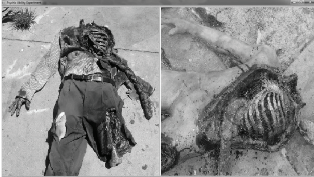
Figure 3. Example stimuli for the negative reward condition.

As per the Hitchman et al. (2012) study, randomisation of the on-screen image array positions and computer target selections was achieved using the random number generation function within VB.NET, which is seeded by the CPU timer. Goodness of fit tests were conducted on the experimental data to evaluate whether or not adequate randomisation had been achieved. The tests revealed there was no bias in the number of times each target was selected by the computer, \chi^2(1, N = 1000) = 0.68, p = .41 , nor a left/right bias in the positioning of stimulus images on screen, \chi^2(1, N = 1000) = .06, p = .80 .